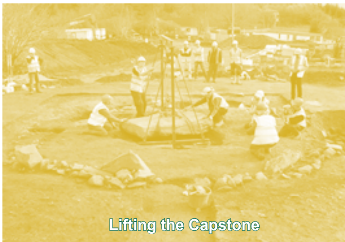
Lifting the Capstone

The excavation also revealed three standing stones within a ring-shaped ditch at the centre of the site. This ditch encircled a large cist covered by a 2-tonne capstone. The standing stones had previously formed part of a stone circle and, although the results are still being processed, the monument appears to have originated as a timber circle.