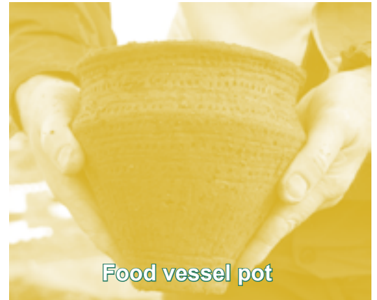
Food vessel pot

at considerable depth in comparison to the cists and could date to before the Bronze Age burials. Other areas of the site have revealed pits containing cremations and evidence of early stone tool manufacturing. Evidence of prehistoric agricultural activity on the site is also intriguing.