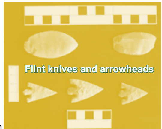
Flint knives and arrowheads

Arc-Eolas Shleite (Archaeology Sleat) was formed by the Sleat Community in response to the dig and hopes to reconstruct part of the site near to its original location. It is also the intention of the archaeologists and the committee that the artefacts will return to Armadale for display in the near future.