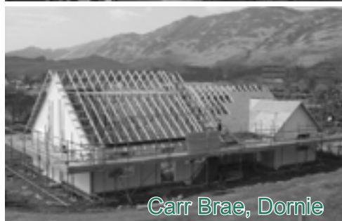
Carr Brae, Dornie

Work started on site at Dornie on 15th June 2009 . The estimated completion date of the 8 special rented properties and a Day Centre on behalf of The Highland Council is 23rd July 2010 .