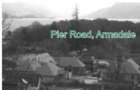
Pier Road, Armadale

There will be 5 rented properties and 6 shared equity properties, and they are due for completion on 27th August 2010 .